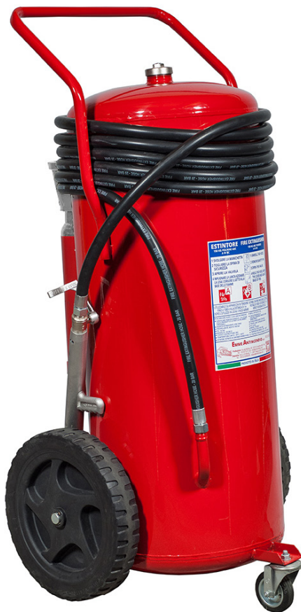
Note: Image is for illustrative purpose only, the product bought can has some differences