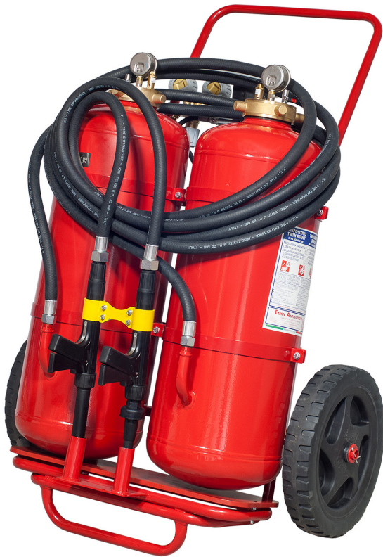
Note: image is for illustrative purpose only

NOTE : This device can not be approved as a fire extinguisher. It must be used by at least 2 operators.